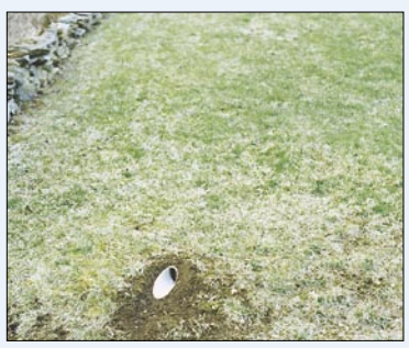
Pipe terminations like this one will be covered with snow and ice in the winter. This is not a problem if you have the IceGuard® System!